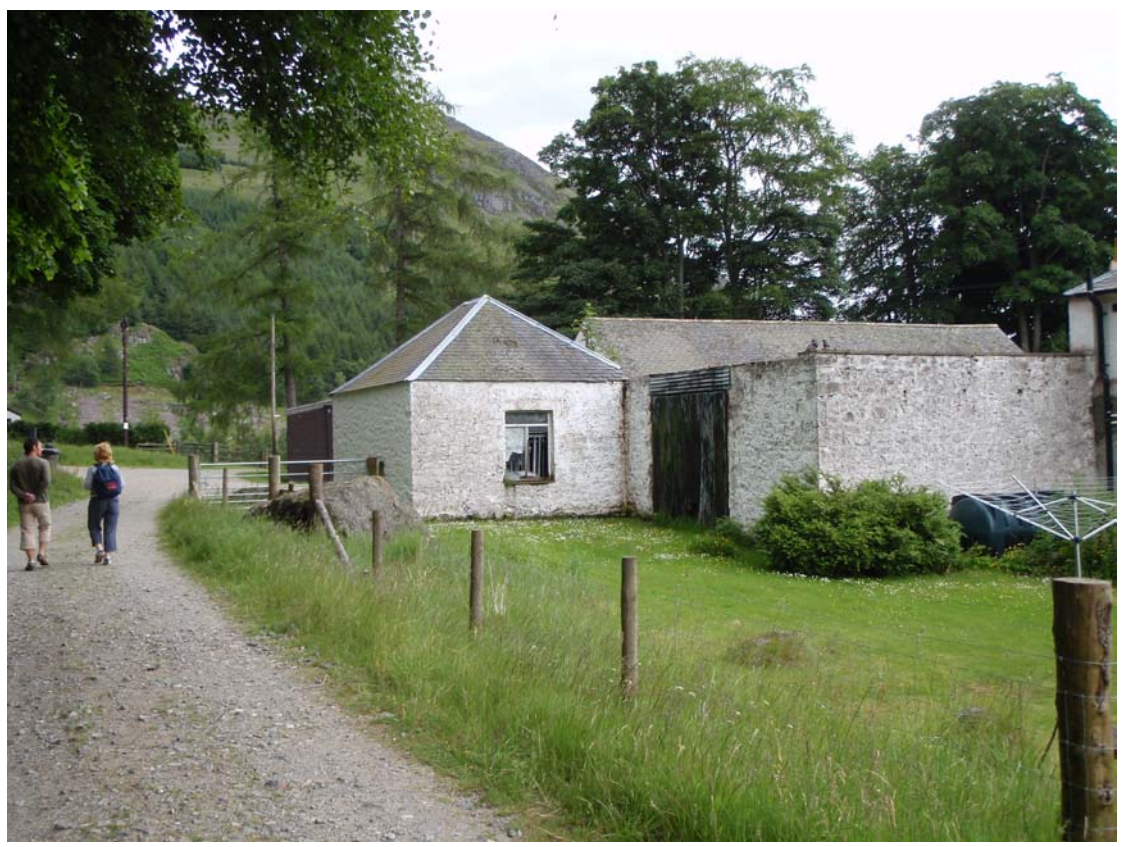
Fig. 3 - View of building looking from walking routes