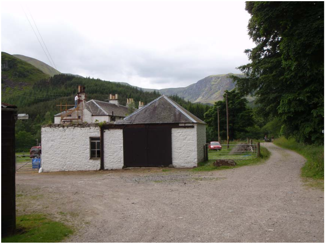
Fig. 2 - View of building from access track at start of walking routes.