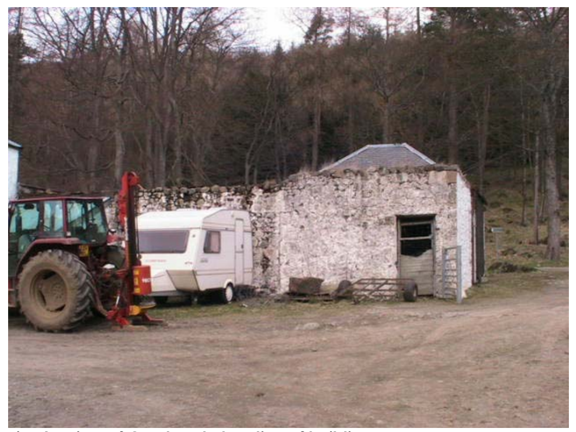
Fig. 4 - View of Courtyard elevation of building